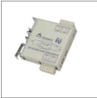
Q510-0xxx (2 Channel) Q510-4xxx (4 Channel)